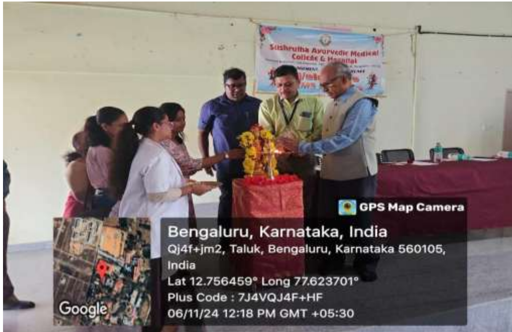
Lighting the lamp by Dignitaries and student representatives