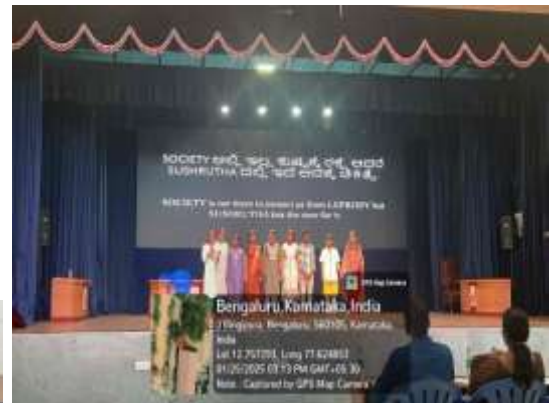
Skit by students of Second year (Griffins) on “Eradication of stigma associated with Leprosy”