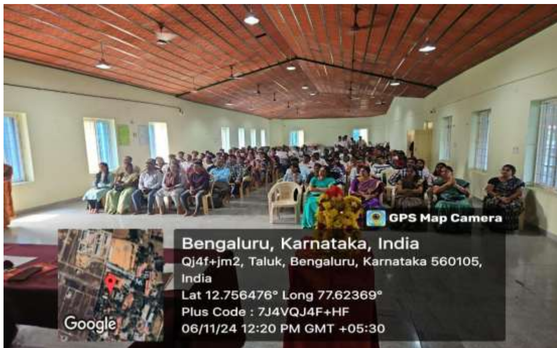
Gathering of parents and student