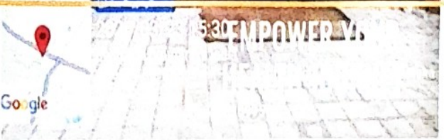
2026/03/23 11:14 Devarakaggalaha, Karnataka, India VG49+RVX, Pipe Line Rd, Devarakaggalaha, Uttarahalli -Manavarthekeval, Karnataka 560109, India