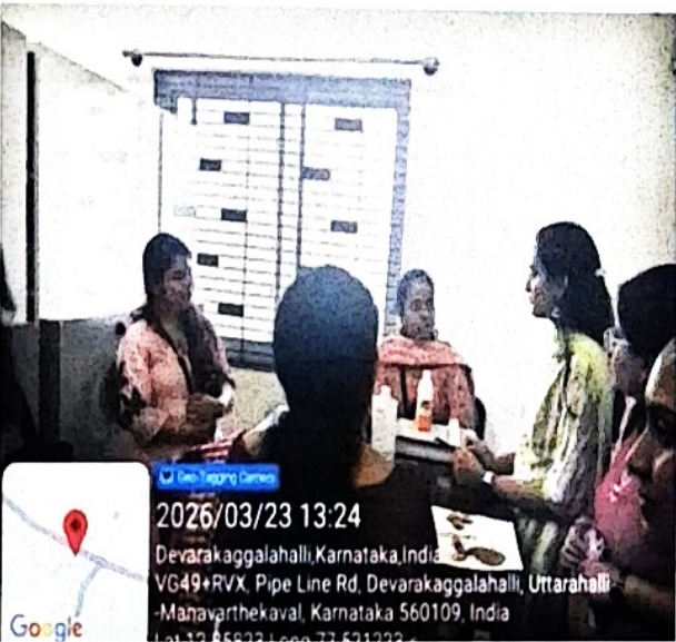
2026/03/23 13:24 Devarakaggalaha, Karnataka, India VG49+RVX, Pipe Line Rd, Devarakaggalaha, Uttarahalli -Manavarthekeval, Karnataka 560109, India Lat 12.657988 Long 77.520645