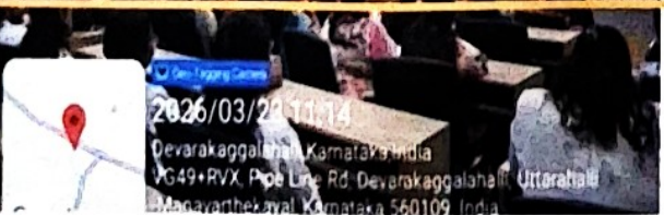
2026/03/23 11:14 Devarakaggalaha, Karnataka, India VG49+RVX, Pipe Line Rd, Devarakaggalaha, Uttarahalli -Manavarthekeval, Karnataka 560109, India