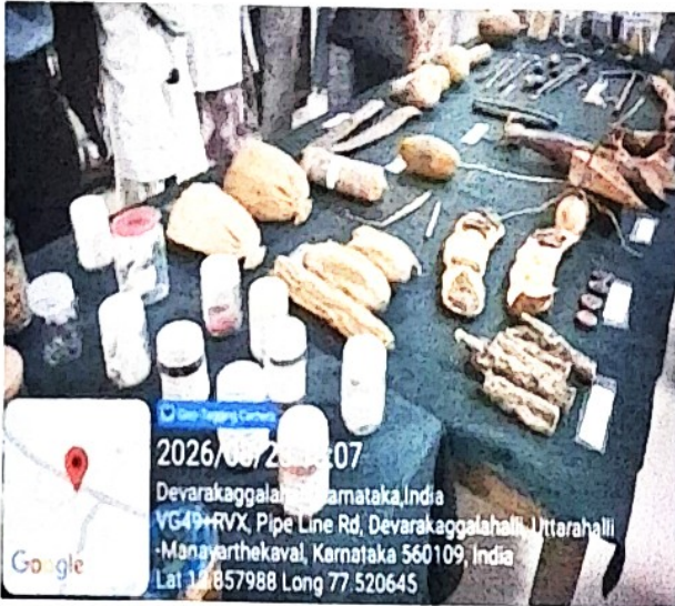
2026/03/23 13:07 Devarakaggalaha, Karnataka, India VG49+RVX, Pipe Line Rd, Devarakaggalaha, Uttarahalli -Manavarthekeval, Karnataka 560109, India Lat 12.657988 Long 77.520645